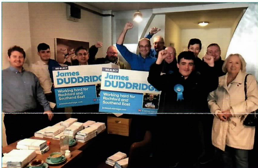
Local people are backing James Duddridge and the Conservatives!

Your local polling station will be open between 7am and 10pm. Vote Conservative to get Brexit done and unleash Britain's potential.